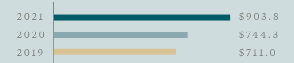
INVESTMENT BANKING VOLUME OF TRANSACTIONS CLOSED (BILLIONS)