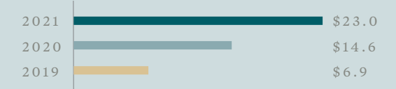
PUBLIC FINANCE VOLUME OF TRANSACTIONS CLOSED (BILLIONS)