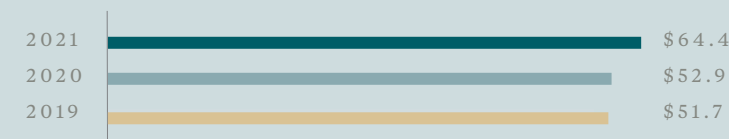
ASSETS UNDER ADMINISTRATION (BILLIONS)